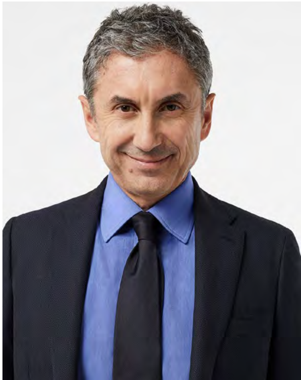
MARCO GOBBETTI Chief Executive Officer