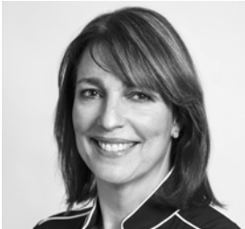
Dame Carolyn McCall (55) ††